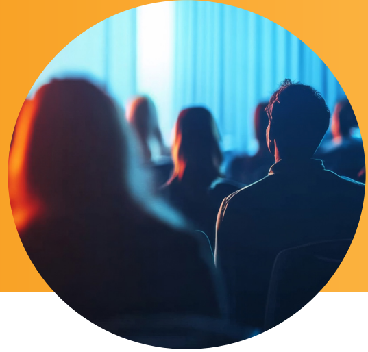
Table of 10